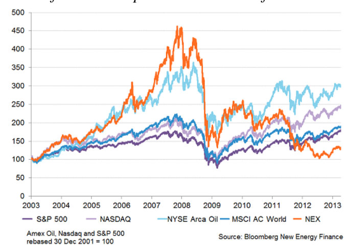
AMEX Oil, Nasdaq, S&P 500 rebased 30 Dec 2001 = 100

Below is the NEX Index vs. NYSE Oil vs. Nasdaq vs. S&P500 vs. MSCI World for the past 10 years to late 2013. Note Global NEX that had been well up - indeed was at very top in late 2007 at 450 - instead finishes this period to late 2013 far down at bottom nearer the 100 seen a decade ago: