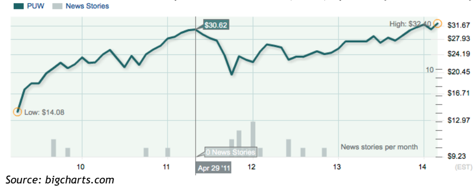
Chart for the WHPRO Index, nearly past 4 years to early 2014: